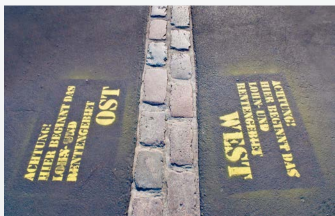
Berlin: Weimar & Nazi Germany, Origins of the Cold War