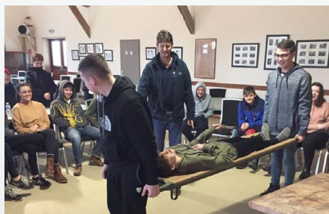
Ypres & Somme: Surgery & Treatment in the Trenches