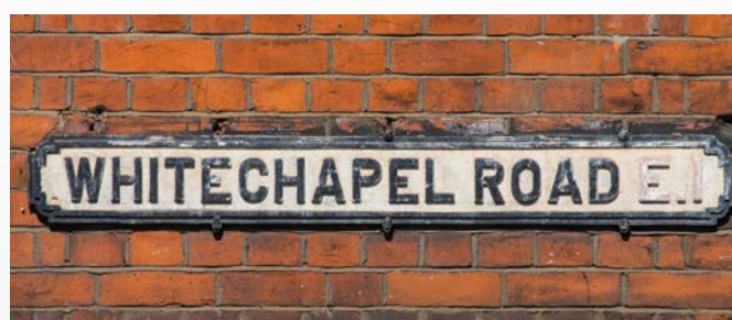
London: Whitechapel, Crime & Policing

Anglia Tours itineraries endorsed by Pearson Edexcel include: